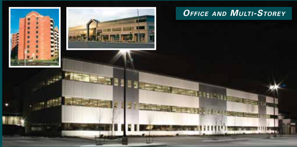
OFFICE AND MULTI-STOREY